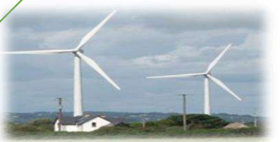
Wind Turbine & House