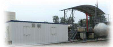
Skid-Mounted Oil Mass Flow Meter