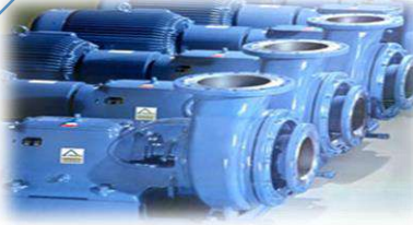
Chemical Process Pumps