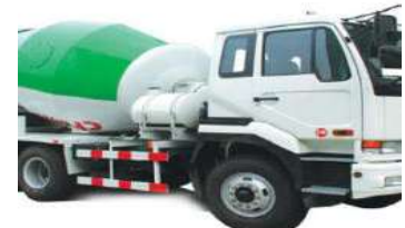
Concrete Mixing Truck