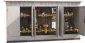
District Regulator Cabinet