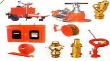
Fire Hydrant System