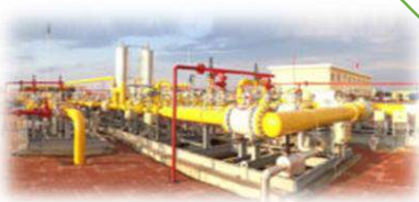
Skid-Mounted Pressure Reduction Metering Station