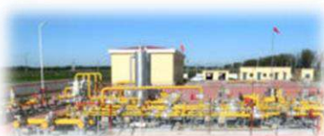
City Gas Gate Station/Storage & Distribution Station