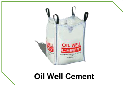
Oil Well Cement