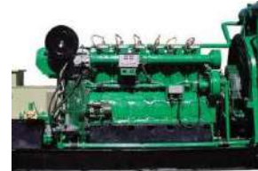
Natural Gas Generator