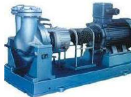
API Standard Pumps