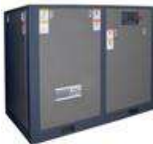
Rotary Air Compressor