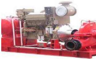
Engine Driven Fire Water Pump