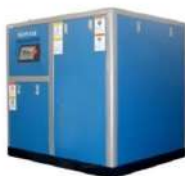
Rotary Screw Air Compressor