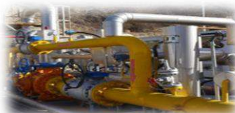
Gas Gathering Skid