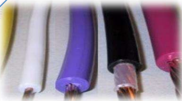
Cathodic Protection Cable