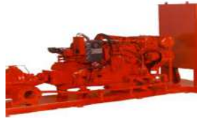
Electric Driven Fire Water Pump