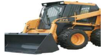
Skid Steer Loader