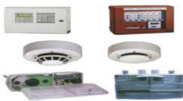
Fire Alarm System