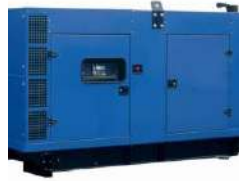
Silent Diesel Generator