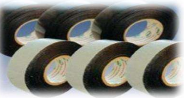
PE Anti Corrosion Tape