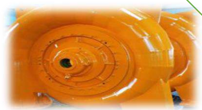
Hydro Power Turbine