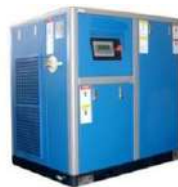
Electric Screw Air Compressor