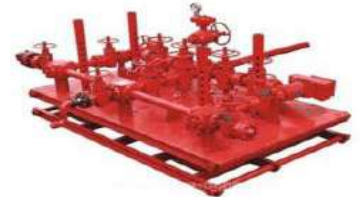
API Choke Manifold