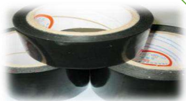
Outer Wrapping Tape