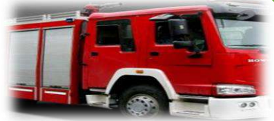
Foam Water Tank