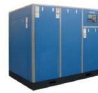
Single Oil Free Screw Air Compressor