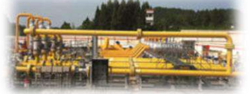
Turbine / Ultrasonic Metering System