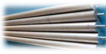
Magnesium Anode For Cathodic Protection