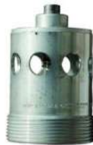
Back Pressure Check Valve