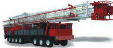
Truck Mounted Drilling Rig