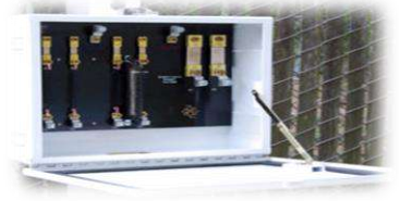
Junction Box W