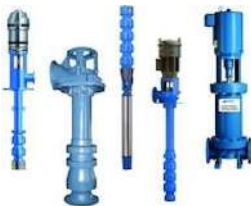
Vertical Turbine Pumps