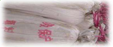
Pre-Packaged Magnasim Anodes