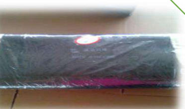
Heat Shrink Sleeves