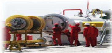
Pig Launcher and Receiver