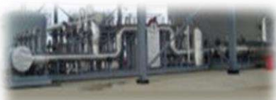
Mobile Injection, Dissolution & Dilution System