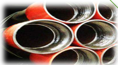
API 5CT Casings