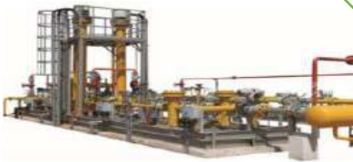
Gas Metering & Regulating System