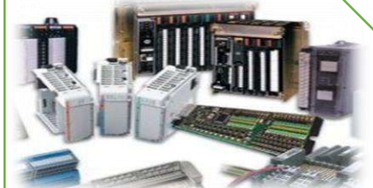
Allen Bradley PLC Prog;