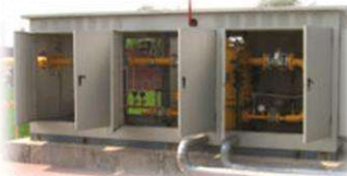
Skid-Mounted CNG Pressure Reducing Station