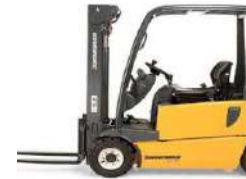
Electric Fork Lifter