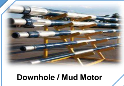
Downhole / Mud Motor