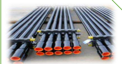
Heavy Weight Drill Pipe