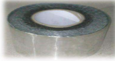
Aluminum Wrapping Tape